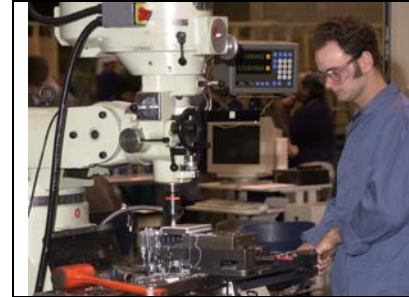
Competitor at the Canadian Skills Competition in Edmonton June 1, 2001.

The Skills Ontario office has created another